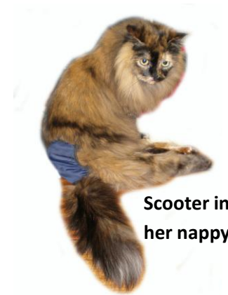
Scooter in her nappy !